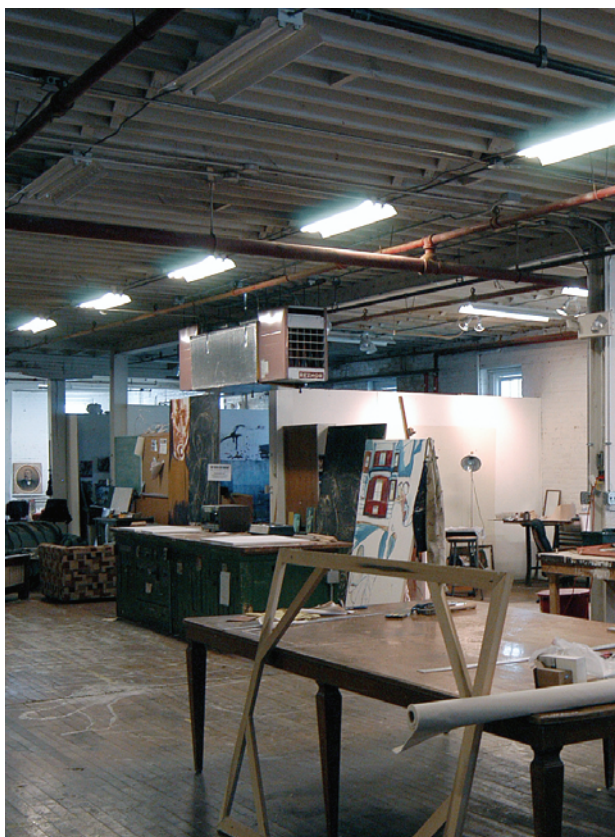
THE TROUT GALLERY Dickinson College Carlisle, Pennsylvania